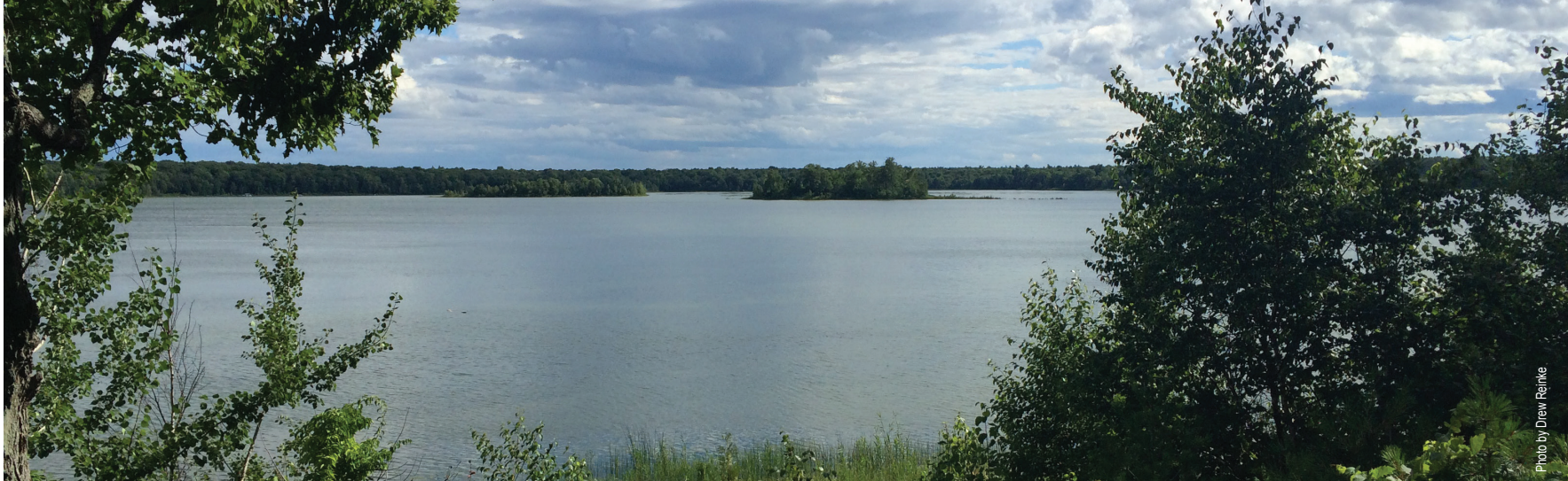
Lake MacKaysee and its two interior islands