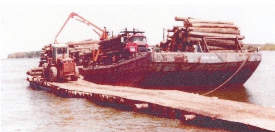
Temporary North Bay logging dock in 1983

The Chambers Island Nature Preserve is an essential component of Door County Land Trust's conservation portfolio. "We spend a lot of time with local and statewide conservation partners, determining the areas of Door County where our work will have the greatest ecological impact," says Terrie Cooper, Director of Land Program. "Chambers Island's contiguous forest of hemlock, red oak and sugar maple and its 300-acre inland lake, Lake Mackaysee, are vital stopover habitat for migratory birds on the Lake Michigan flyway. Protection of the Island's biodiversity, woodlands and shorelines is essential for the thousands of birds that migrate every year from their wintering grounds in central and south America to their nesting habitat in Canada."