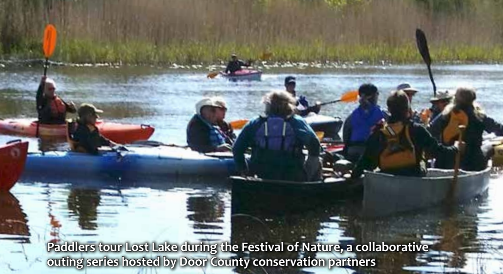
Paddlers tour Lost Lake during the Festival of Nature, a collaborative outing series hosted by Door County conservation partners