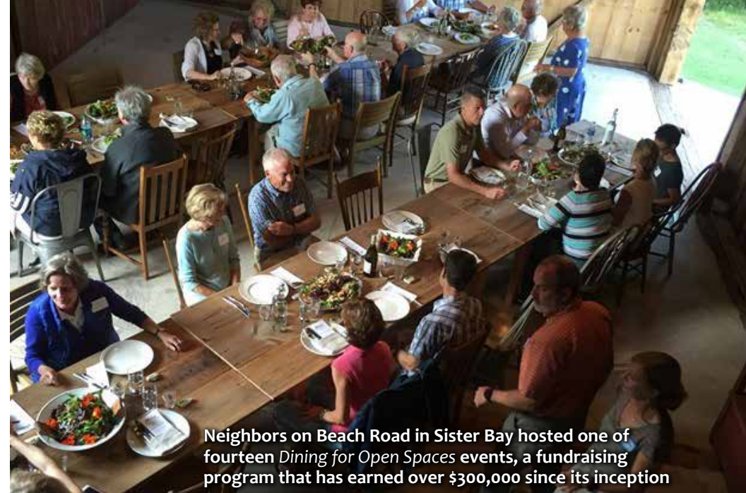
Neighbors on Beach Road in Sister Bay hosted one of fourteen Dining for Open Spaces events, a fundraising program that has earned over $300,000 since its inception