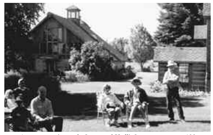
A summer outing at the James and Phyllis Ingwersen property, 100 acres under a conservation easement.

When owning land, a person also "owns" many rights associated with land ownership, such as the right to build residences and buildings, place structures such as billboards and communication towers, subdivide the land, clear the forest, and so on, subject to local zoning ordinances. A property owner that enters into a conservation easement with the Door County Land Trust permanently restricts some of these activities in order to protect the scenic and consevation values of the land.