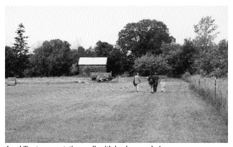
Land Trust representatives walk with landowners during an annual monitoring visit.

If a future landowner or someone else violates the easement, for example by subdividing the property if the easement prohibits its subdivision, the Door County