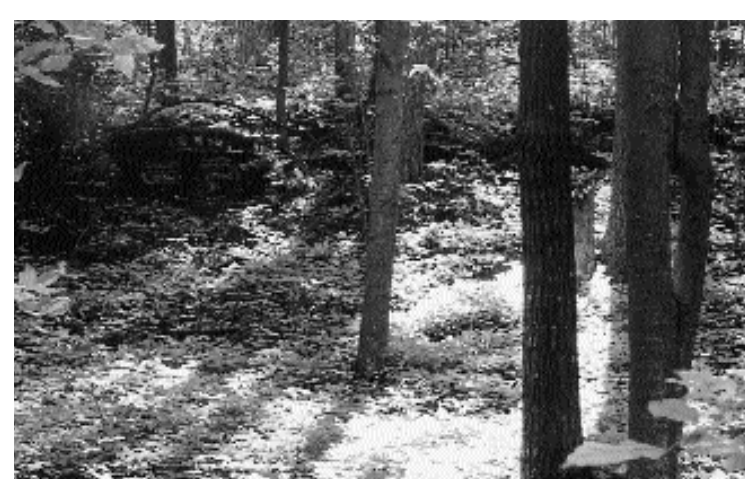
Property along the Niagara Escarpment purchased by the Door County Land Trust

In a bargain sale the landowner realizes the actual revenue from the sale price as well as a tax-deductible charitable gift. The difference between the land's fair