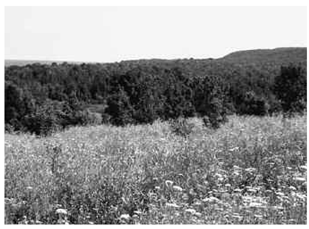
Door County Land Trust's Bay Shore Blufflands Preserve

If you are selling property and interested in locating a conservation buyer or if you are seeking to buy and preserve land, contact the Door County Land Trust for more information about our Conservation Buyer Program.